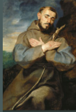
Saint Francis of Assisi October 16th at 7:30 PM