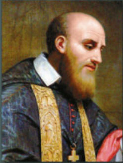
Saint Francis de Sales September 18th at 7:30 PM