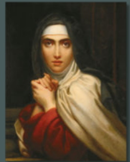
Saint Teresa of Avila September 25th at 7:30 PM