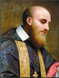
Saint Francis de Sales September 18th at 7:30 PM