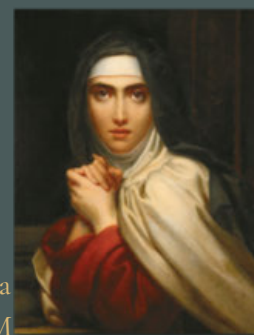
Saint Teresa of Avila September 25th at 7:30 PM