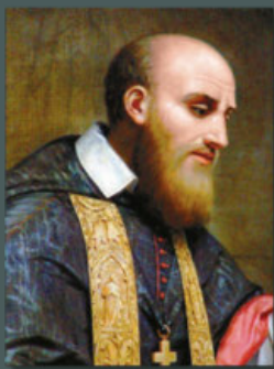
Saint Francis de Sales September 18th at 7:30 PM