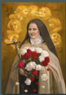
Saint Thérèse of Lisieux October 2nd at 7:30 PM