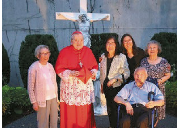
Solemn Pontifical Mass with Cardinal Burke in honor of Our Lady of She-Shan for Catholics in China on July 25, 2023.