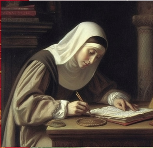
Saint Catherine of Siena Tuesday, February 20, 7:30 pm