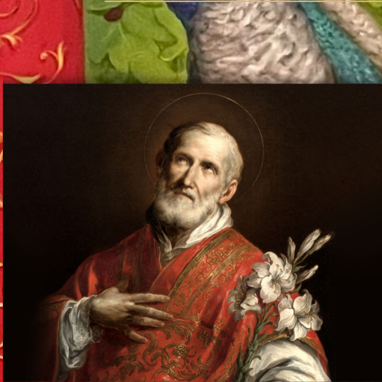
Saint Philip Neri Monday, March 4, 7:30 PM