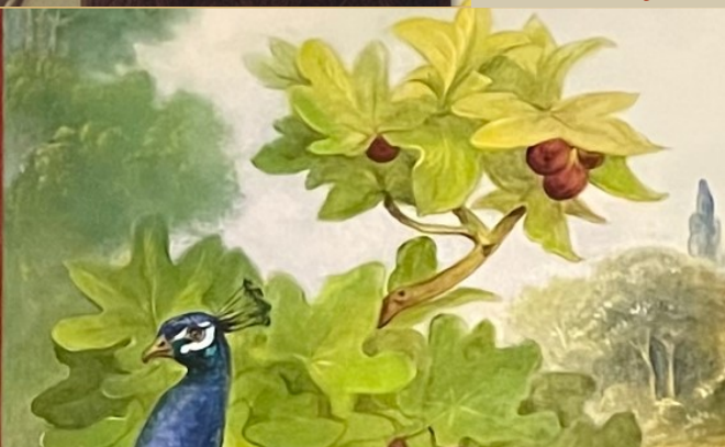
Saint Augustine of Hippo Monday, February 26, 7:30 PM