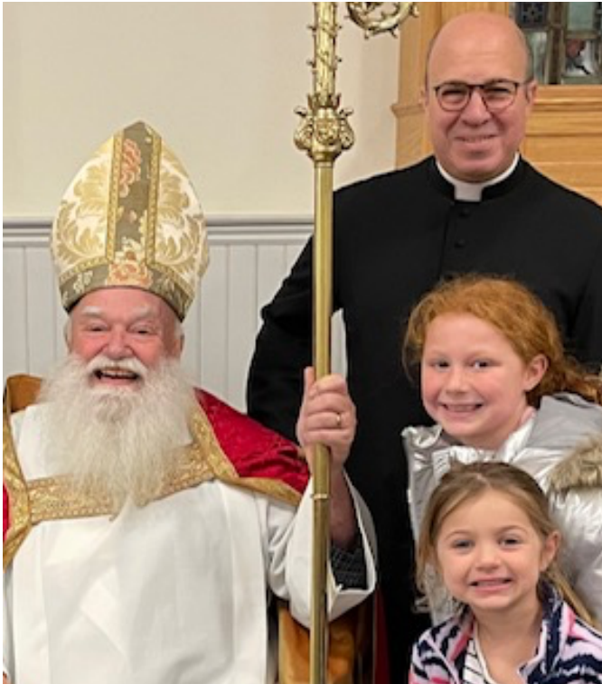
A few pictures from our St. Nick party on Decemr 3, 2023.

Please join us on Wednesday, December 27, 2023 for Mass to celebrate Our Patron Saint, Saint John the Evangelist. We will have the traditional Blessing of Wine following the Mass.